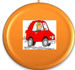
Travel Wise Team